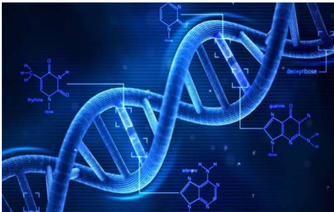
Fig1: DNA Computing