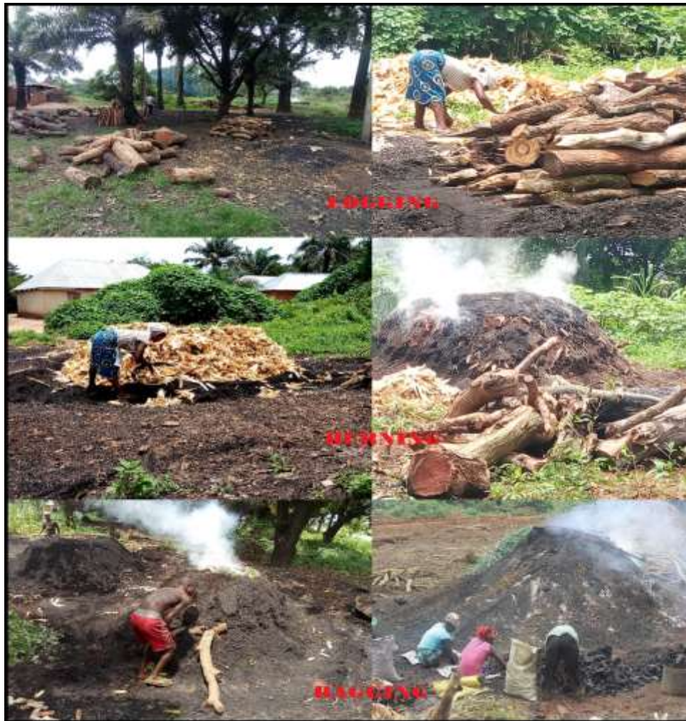
Plate 4 Stages of Charcoal Production Activity in the Study Area