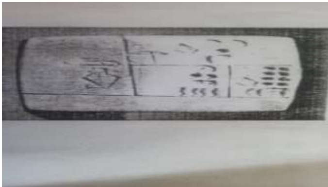
Figure 2. Inscriptions on clay as a record

The token gradually began around 4100 to 3800 BC to become the symbols usually inscribed in clay to represent a record of a number of lands or properties, and that was exactly when the written language began developing. Of the earliest examples one was found in the excavations of Uruk in Mesopotamia at a level representing the time of the crystallization of the Sumerian culture as seen below: