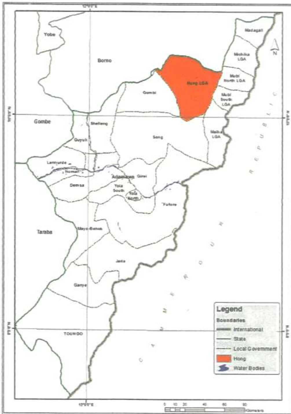
Map of Adamawa State Showing Hong Local Government Area